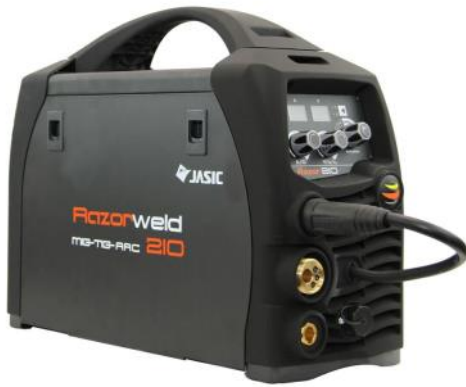
INVERTER MIG/TIG/ARC 210A