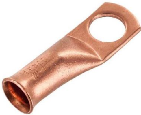
LUG CABLE L-1020 #1/0-2/0