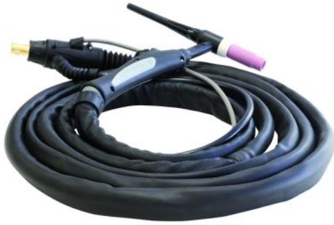
TORCH TIG 17 HNDCTRL 200A