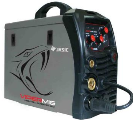
INVERTER MIG ARC VIPER180