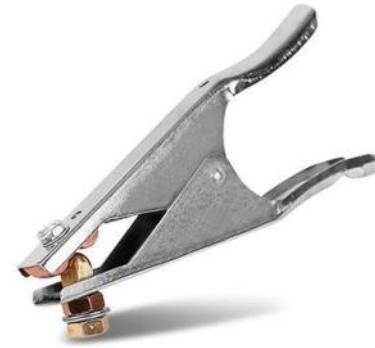
CLAMP 300A STEEL GROUND