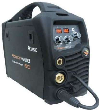
INVERTER MIG/TIG/ARC 180A