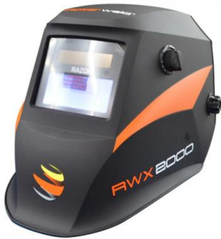
MASK AUTO 3.54X1.57" 9-13