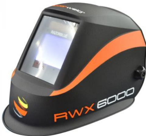
MASK AUTO DIGTL 3.94X3.28