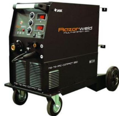
MULTISYS 250A MIG-ARC-TIG