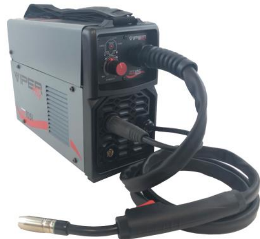
INVERTER MIG 40-105A 110V