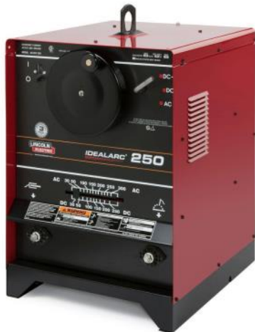
PLAN IDEALARC 250ACDC PFC