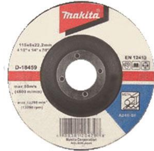
DISC GRN 4.5X1/4X7/8 MS