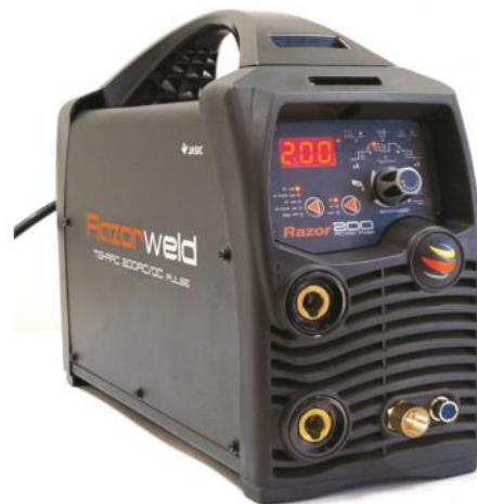
INVERTER TIG 200A ACDC HF