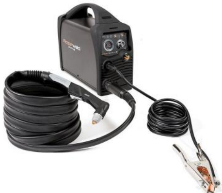
PLASMA CUTTER 45 220V