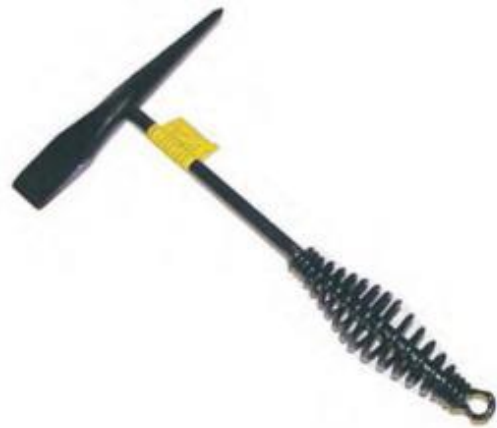
HAMMER CHIPPING SPRING1LB