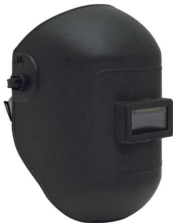
MASK WELD 2X4.25"BLK TERM