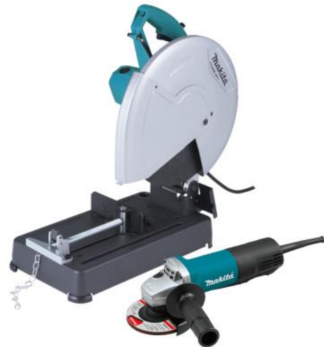
CHOPSAW 14"15A+4.5"GRN MT