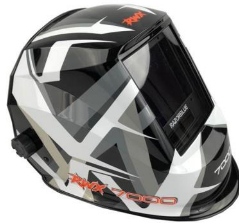
MASK AUTO DIGTL 3.94X3.28