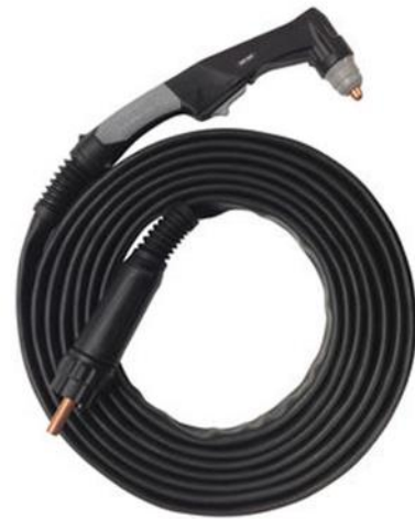
TORCH PLASMA SURE 19'TRF