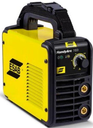
INVERTER ARC 160A 220V