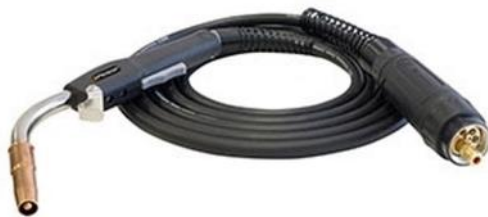
TORCH MIG 10'200A 025-035