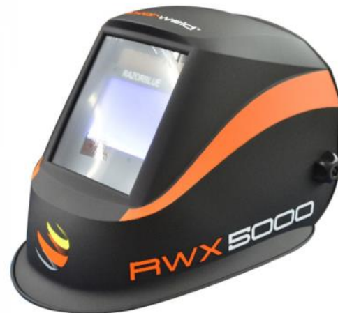
MASK AUTO 3.94X2.36" 9-13